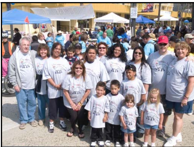
The 2007 Hillmont IPU Team and their T-shirt design!