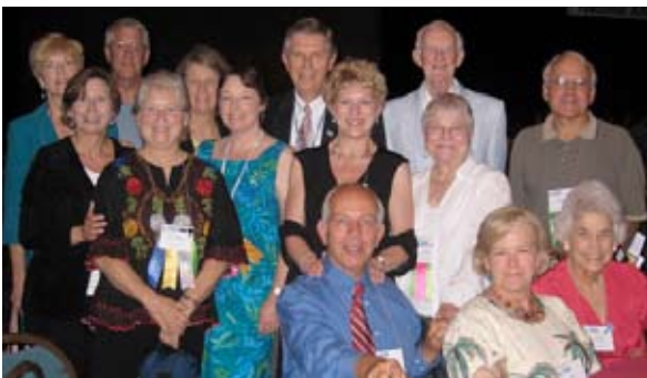
NAMI MEMBERS NAMI NATIONAL CONFERENCE