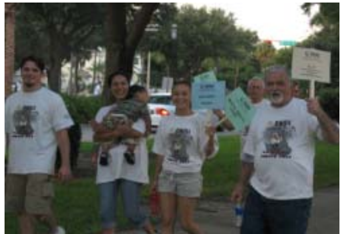
Volunteers stroll around Straub Park last year for the END THE MYSTERY Mental Illness Awareness event. The stroll will be held in 2008 on Sunday, October 12th. Come and help us educate the public about mental illness, stigma, discrimination and recovery. If you don't attend the banquet, separate registration for the stroll is $20. (See page 6.)