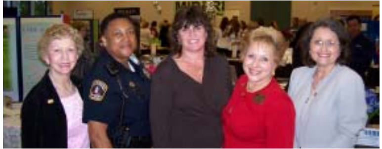
NAMI members joined other local business women at Largo Cultural Center

The Pinellas Park-Gateway Chamber of Commerce 2008 "Country in the Park Trade Show" will host the Community Service Expo, a showcase for area non-profit and government agencies Visit the NAMI Pinellas County booth on Saturday, March 15 th beginning at 10 am, at the England Brother's Bandshell, located in Pinellas Park at Town Square Plaza Park.