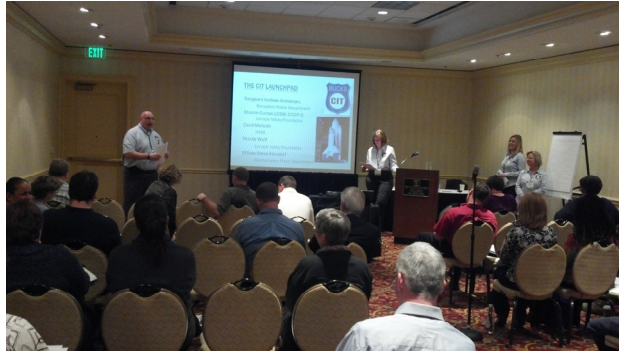
The Bucks County CIT Task Force presenting "CIT Launchpad" in Orlando, Florida.

Funded by the Department of Justice, the aim of the conference was to enhance knowledge, skills and attitudes of providers who serve those with disabilities that are victims of crime, abuse and/or neglect. The CIT team was awarded one of the limited numbers of multidisciplinary Community Team Scholarships to present at the conference. On Wednesday, December 14, 2011, the CIT Task Force team presented " CIT THE LAUNCHPAD ". The team discussed how Bucks County implemented a Crisis Intervention