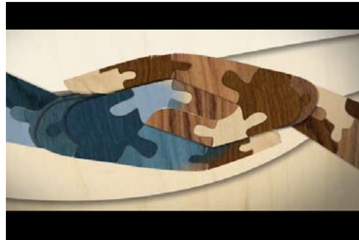
We cut to them interlocking hands. We watch as her "warmth" spreads to our puzzle man (there should be warm wood pieces on our puzzle man).