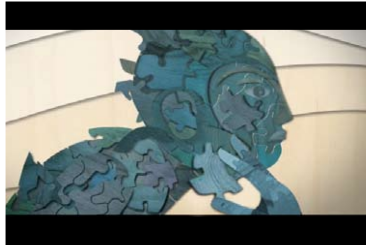
We cut to a close up of our puzzle man putting the piece back into place. We see other pieces fall off him.