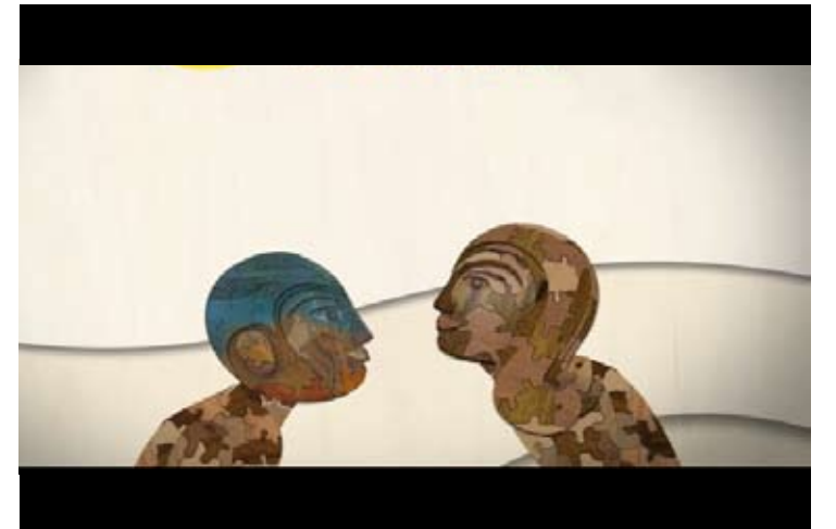
Cut to a wide as we see that our blue puzzle man is now a warm puzzle man like our "NAMI" person.