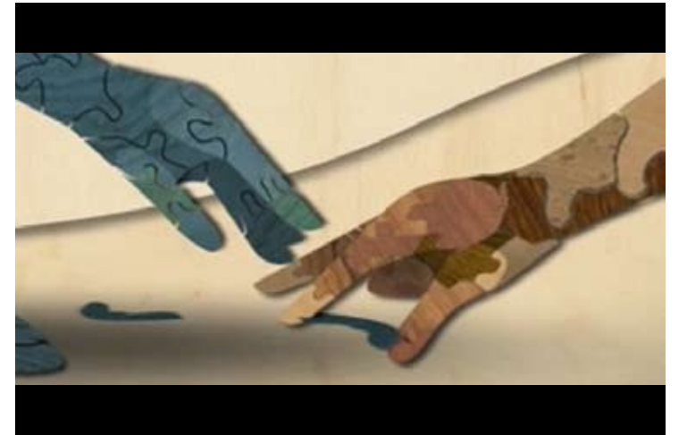
As he reaches for another piece, we see another hand come in and pick up the piece that our puzzle man was reaching for.