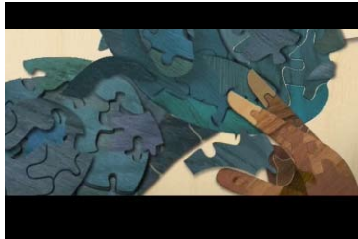
We cut to a close up of our "NAMI" person placing the fallen puzzle piece back into place.