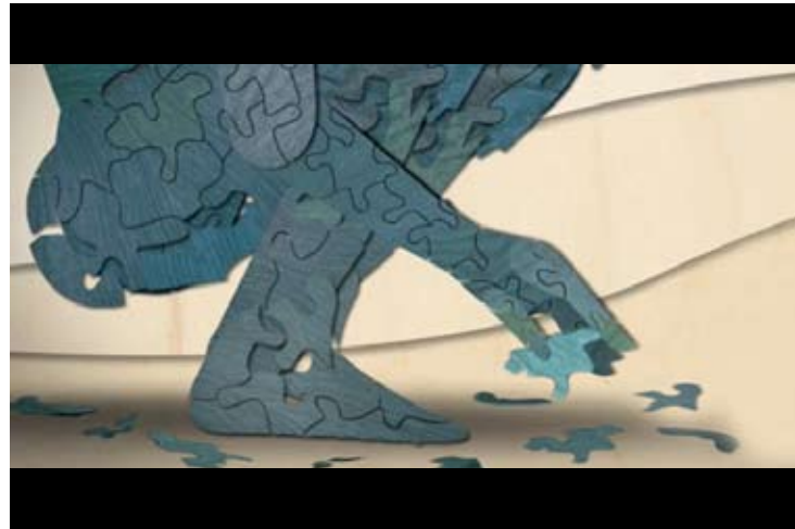
We widen out to reveal a blue puzzle man picking up the fallen puzzle piece.