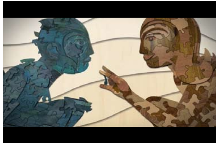
The camera widens out to reveal a friendly "NAMI" person. She is holding a blue puzzle piece.