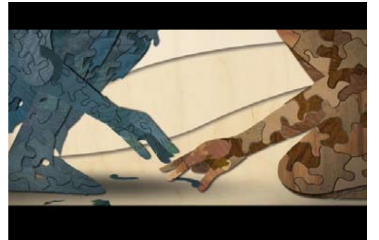
We cut wide again to see our "NAMI" woman picking another puzzle piece up.