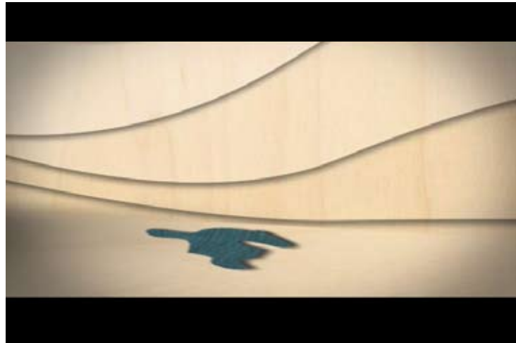
Open on a falling puzzle piece.