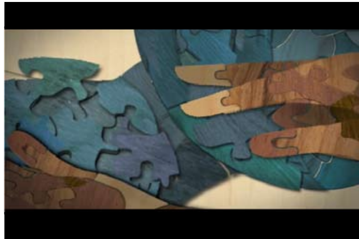
She then places another puzzle piece onto a different location on the puzzle man's body.