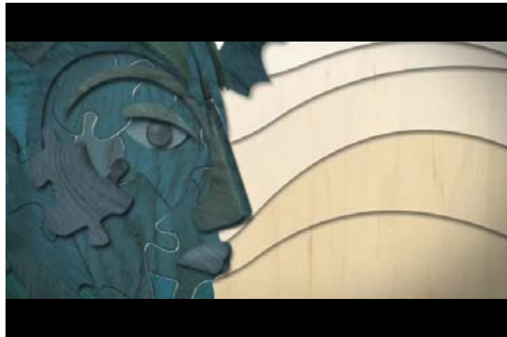
We cut to a close up of our man looking up with a quizzical look on his face.