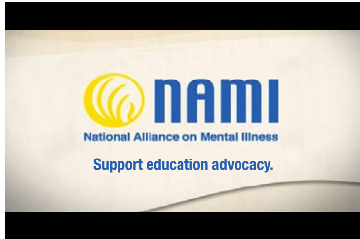
We end on the NAMI logo,